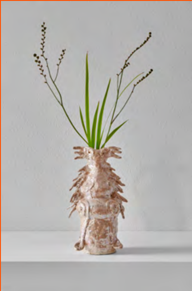
Chiara Camoni, Butterfly Vases , 2020 Variable dimensions Courtesy Arcade, Londres & Bruxelles and SpazioA, Pistoia Photo: Camilla Maria Santini